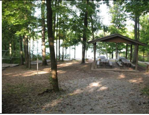
Lakeview: 46 people/ 23 tents