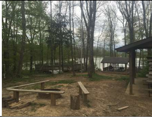
Stuart A & B: A- 36 people/18 tents (15 on 2 deck platforms); B- 24 people/ 12 tents (8 on 1 deck platform)