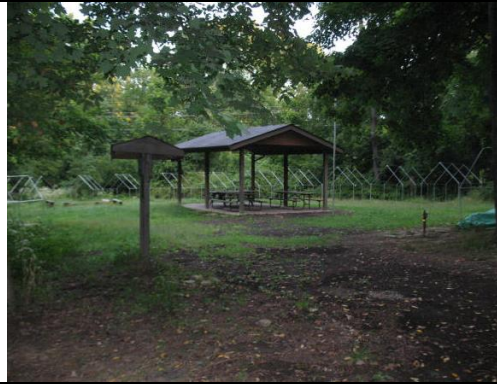
Reed: 36 people/18 tents