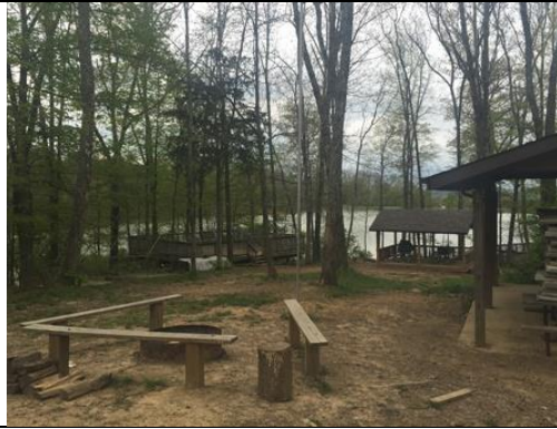
Stuart A & B: A- 36 people/18 tents (15 on 2 deck platforms); B- 24 people/ 12 tents (8 on 1 deck platform)