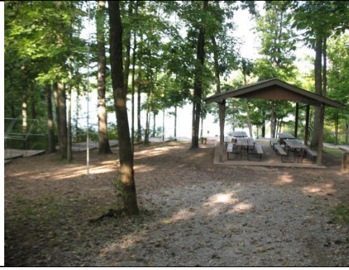
Lakeview: 46 people/ 23 tents