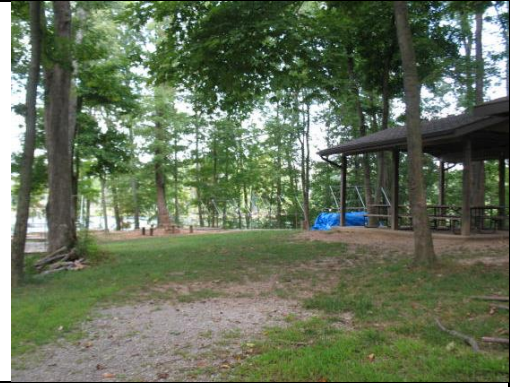
Pike: 32 people/16 tents