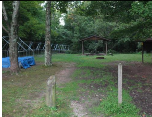
Wereley: 30 people/15 tents