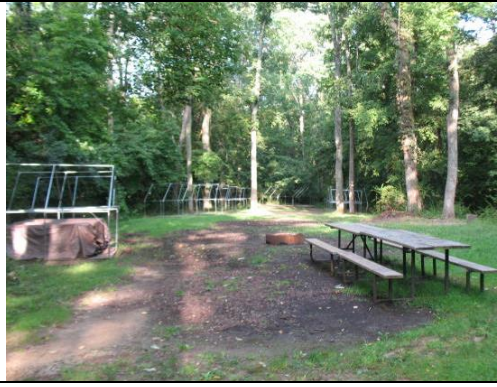
Martin: 40 people/20 tents