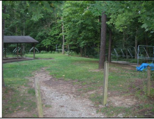
Present: 24 people/12 tents