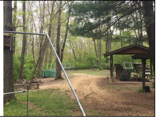
Terhar: 38 people/19 tents