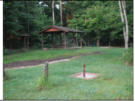
Schuster's Glen A & B: A- 28 people/14 tents; B- 12 people/6 tents