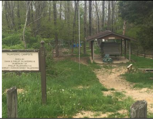
Talliaferro: 38 people/19 tents